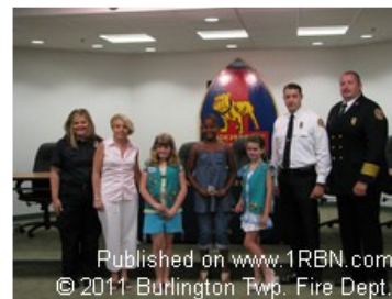
Published on www.1RBN.com © 2011 Burlington Twp. Fire Dept.

Add Bugles to Your Helmet with a Bachelor in Fire Science! Free Info EducationDegreeSource.com/Online